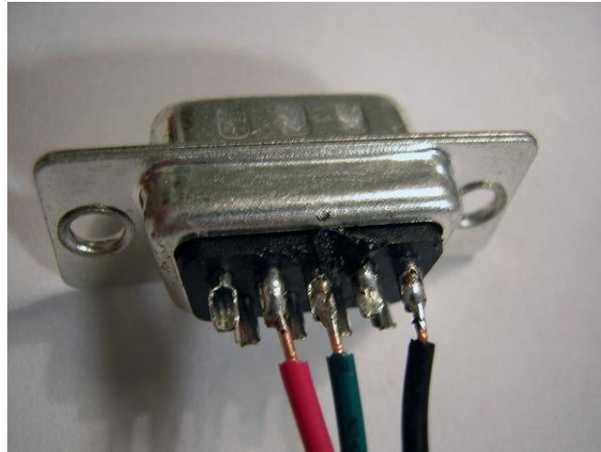
PIC-3. After Soldering